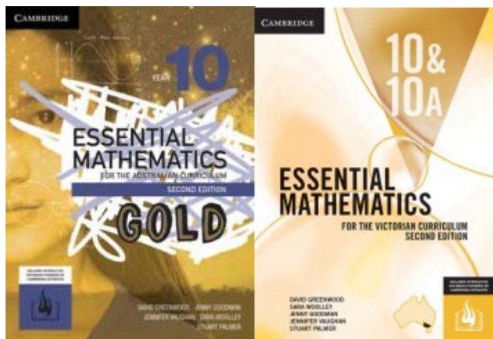
Year 10 STANDARD Maths

Please note there have been changes to the Year 10 Textbooks, Year 10 Standard Maths has the Cambridge Essential Mathematics 10 GOLD AC textbook (same as the year 10 standard maths this year) but Year 10 Advanced Maths has a new textbook , Cambridge Essential Mathematics 10 and 10A for the Victorian Curriculum Second Edition .