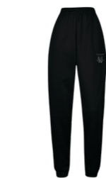
TRACK PANTS Compulsory for PE & Sport