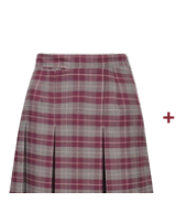
WINTER SKIRT Approved Design Only Optional: Black or Flesh coloured tights or stockings