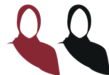
HIJAB Black or Maroon