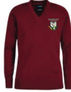
JUMPER Wool or Cotton blend