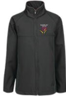
SOFT SHELL JACKET Black with logo