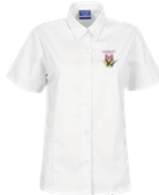
BLOUSE Short or Long Approved Design Only