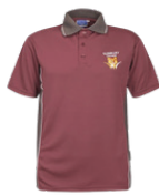
SPORT POLO Compulsory for PE & Sport