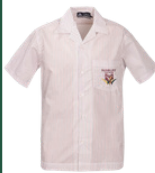
SHIRT Short or Long Approved Design Only