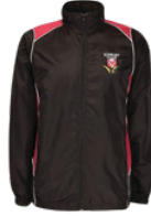
SPRAY JACKET Black with logo