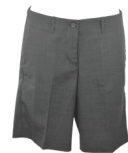
SHORTS Approved Design Only