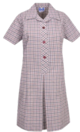
SUMMER DRESS Approved Design Only